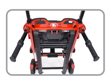
Rear Lift Handles with improved ergonomics for lifting or carrying the chair