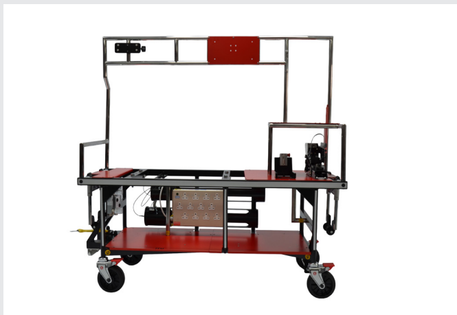
* Above image showing short ITU-PX model, for illustration purposes