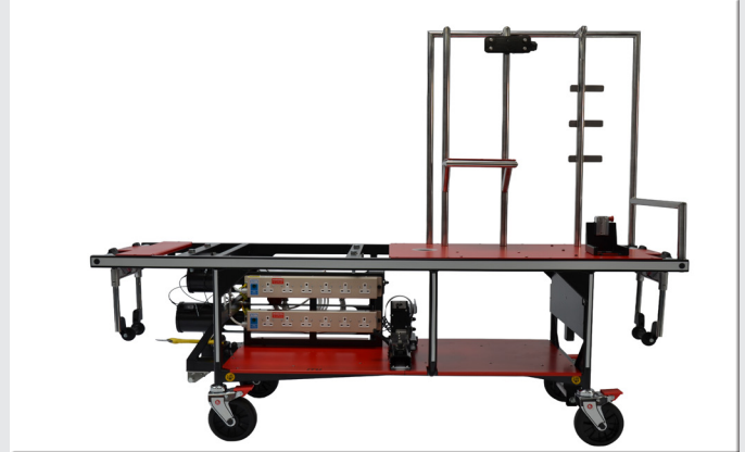
* Above image showing long ITU-PX model, for illustration purposes